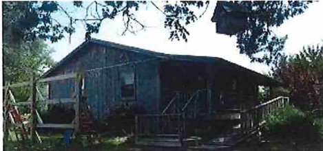
Pin 0150-10-19-101-011-0 Photo